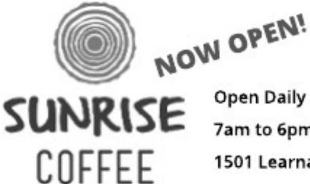
Open Daily 7am to 6pm

Now that Sunrise Project is all moved into our space at 1501 Learnard Ave, there are SO many ways to get involved! Of course, you can always stop by and get coffee and a treat at Sunrise Coffee, which benefits the organization. There are also several workshops and events coming up, so mark your calendars! The first Community Orchard Days of the year will be on Saturday, March 10th and March 31st, 10am to 2pm, so drop by when you can to help out or just enjoy the lovely free food park at 830 Garfield St. Elementary students are invited to cook with us on their day off, Friday, March 9th 10:00 to 11:30am. RSVP on the website or call (785) 865-1618. Sunrise Project is now hosting Community Meals where anyone can come cook and connect. The next meal is on Thursday, March 15th, 5-7pm. All food and beverage supplied; just bring yourself and any companions, friends or family members that would like to participate! MUST RSVP on the website or call (785) 865-1618. Lastly, we'll have a Sunrise Community Garden work day on Saturday, March 24th, 4-6pm (1501 Learnard Ave.). Join us for an afternoon of planting, learning and connecting! Any RSVPs can be done at sunriseprojectks.org/events and you can always check there for future events! See you at Sunrise!