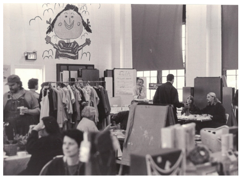
ELNA Meeting March 5th, 2018, 7-9 pm at New York School