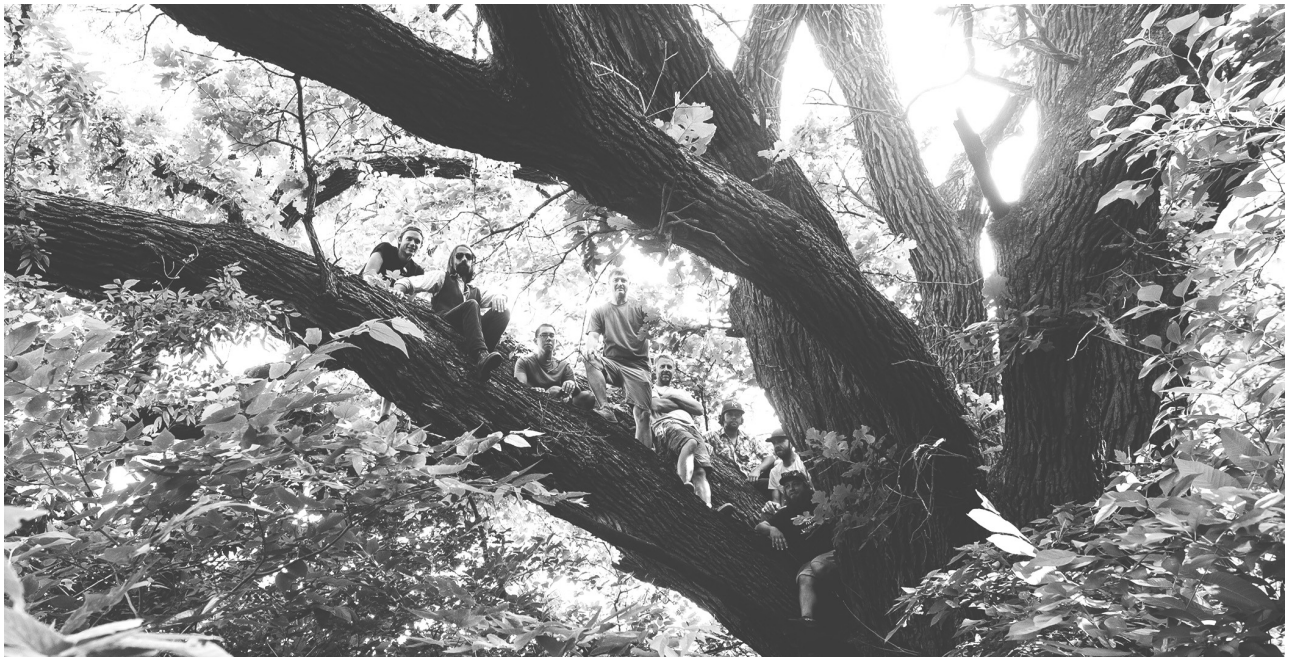
This issue is sponsored by a generous donation from:

PRSR STD U.S. POSTAGE PAID LAWRENCE, KS PERMIT #542