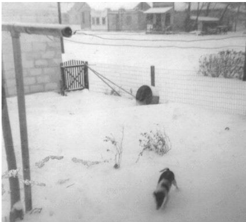
this view shows those bldg.s across 9th from our yard.