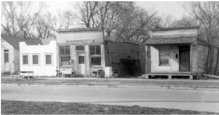
Just a quaint ol' Pic. ca1955 -E.9th between Conn.& N.Y.- Makes you think of a scene out of a old western movie. At the time pic. taken folks lived in those buildings. I believe the little square bldg. possibly was a Cafe in earlier yrs. The bldg. in center was a Used Furn. store in this pic. (alley to the right not shown)