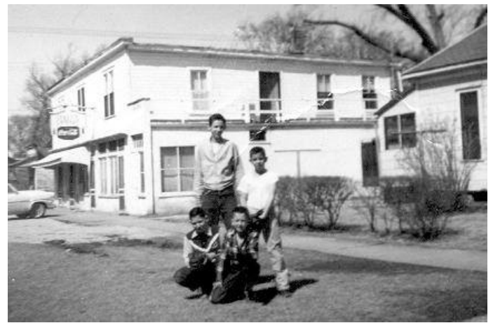
across the alley (not pictured) where Johnsons Service grocery had been yrs. ago.