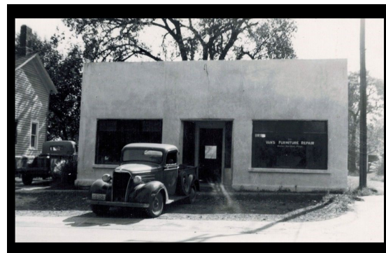
Van's Furniture Repair between Conn. and R.I. right by the alley.