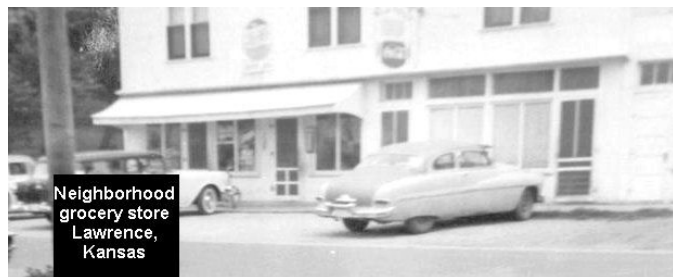
Neighborhood grocery store Lawrence, Kansas

To volunteer or for more information, please visit http://lawrenceks.org/lprd/flowerplanting or individuals may contact the Parks and Recreation administrative office parksrec@lawrenceks.org , (785) 832-3450.