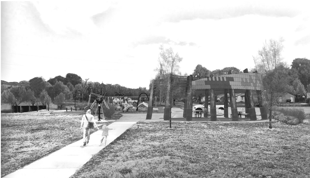
Artistic rendering of the Prairie Block shade structure at Burroughs Creek Park, designed by KU students, with the assistance of neighbors and Prairie Block folks.

For details about the schedule, activities, and partners, check the Prairie Block Facebook page at https://www.facebook.com/Prairie-Block-328644767744798 . See you there!